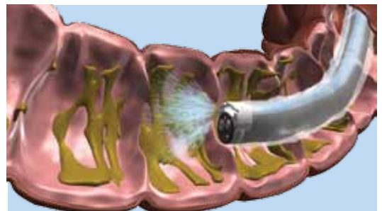
Potent irrigation dislodges debris.