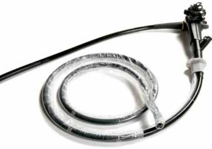
Single use tubing with unique geometry head.