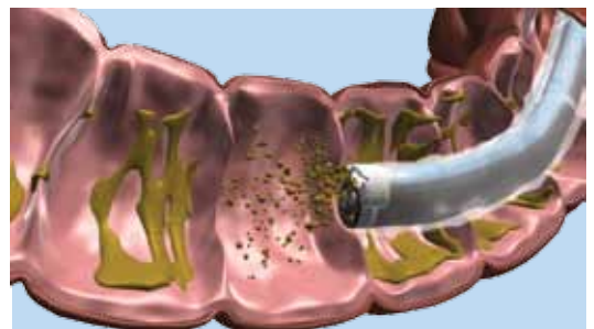
Potent evacuation clears visual field.